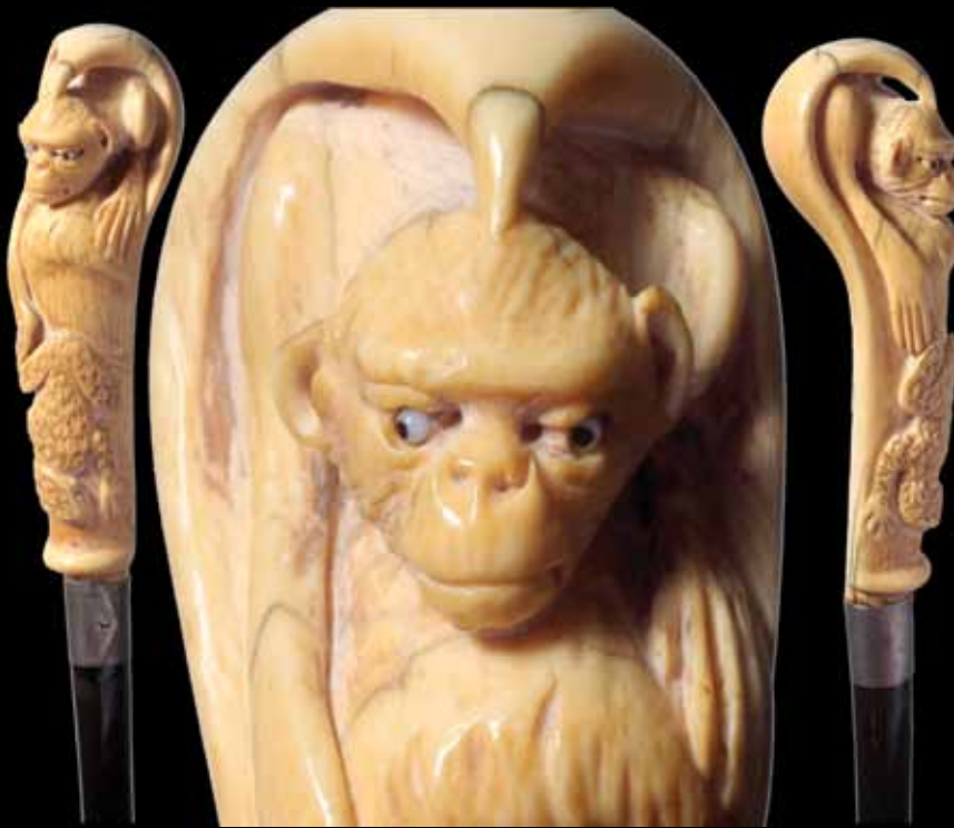
84. Asian Ivory Dress Cane Circa 1890-A carved ape with two color glass eyes which is reaching from the talons to grab a lizard with two color glass eyes, white metal collar, ebonized shaft and a metal ferrule-H. 5 1/2" x 2", O.L. 37" $1,000-$1,300